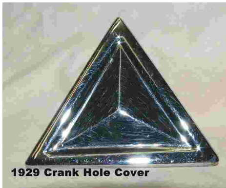
1929 Crank Hole Cover