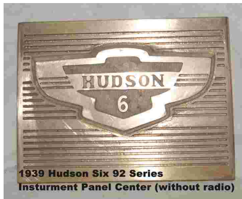
1939 Hudson Six 92 Series Insturment Panel Center (without radio)